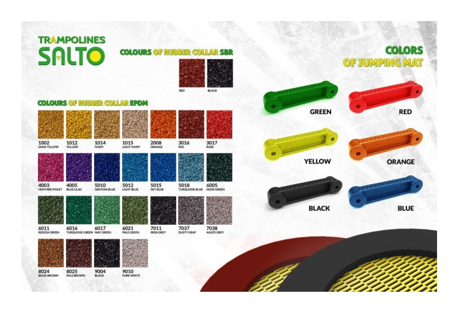
Att. 2. Variety of rubber and jumping mat colours.