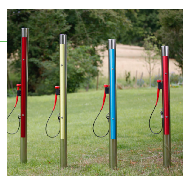
Tuning and Sound Level Data

300 series stainless steel leg, mirror polished. Colour anodized aluminum notes. 1 part vandal resistant mallets with Mallet Minders. Vandal resistant 300 series stainless steel fixings.